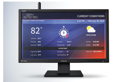
HD Weather Display