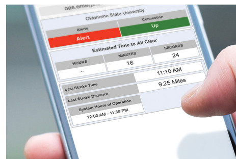
Automatic Countdown Clock with All-Clear Signal