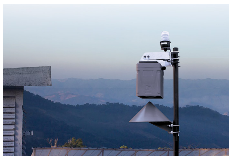
Sferic Siren Automated Lightning Alerting System