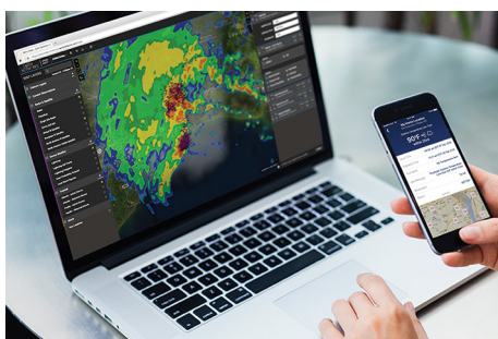
Sferic Maps & Mobile Weather Tracking and Alerting