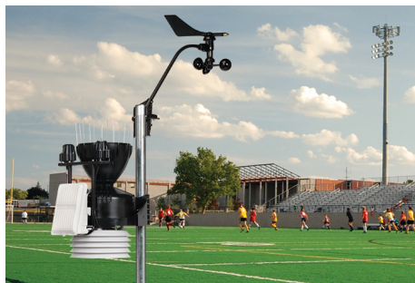
Real-time WBGT Readings From a Weather Station

The Earth Networks Total Lightning Network (ENTLN) detects dangerous in-cloud and cloud-to-ground lightning strikes 24/7, anywhere in the world and passes this information in real time to our suite of weather monitoring and alerting solutions.