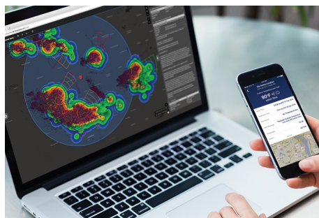
Sferic Maps & Mobile Weather Monitoring and Alerting Dashboard