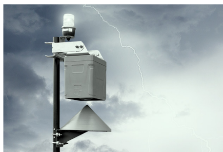
Sferic Siren Automated Lightning Alert System

Get 30 days of weather alerts free with a trial of our Sferic Maps & Mobile solution.