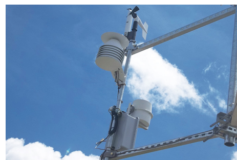
Professional-Grade Weather Station