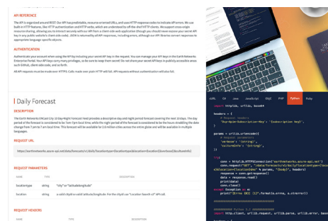
Real-Time Weather API