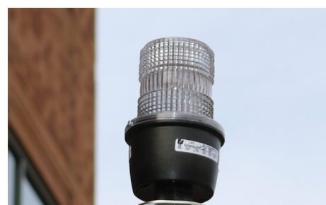
Automated Strobe Lights