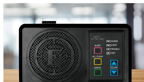
Informer Control Box